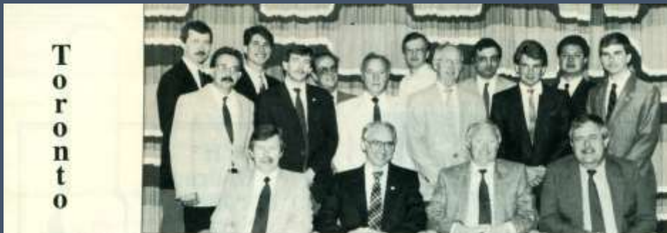
Shown here is the 1990/91 Toronto Section Executive Committee.