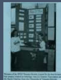
Photograph by 1977 Tribology Section Award for the Best Student Paper project entitled "An Analytical Study of Lubrication Characteristics and Oil Behavior Under High Shear Conditions of Various Alloys."