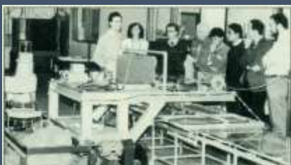
Participants in the first (1987/1988) Continuing-Education Course on Tribology by the faculty of Applied Science and Engineering at the University of Toronto inspect a large-scale laboratory model of a tilting-rod thrust bearing.