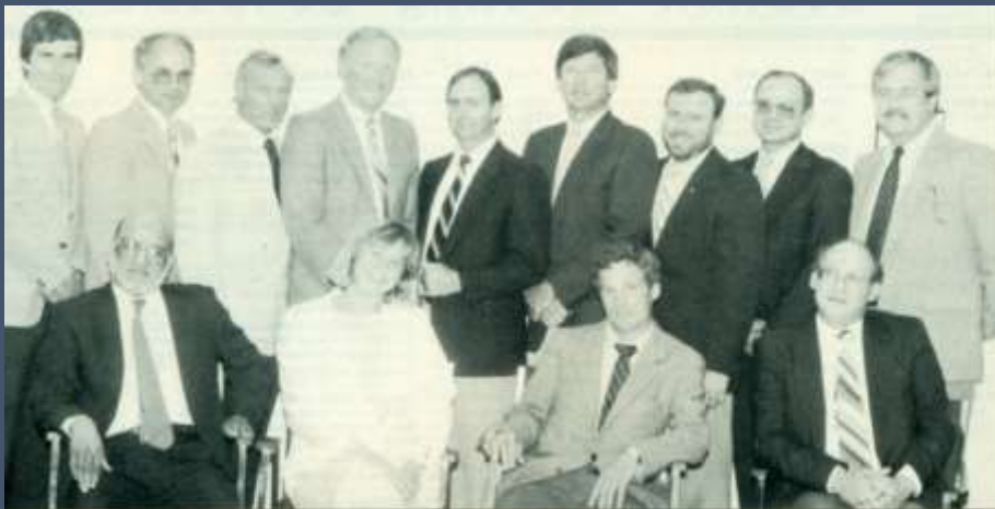
1987/88 TORONTO SECTION EXECUTIVE COMMITTEE