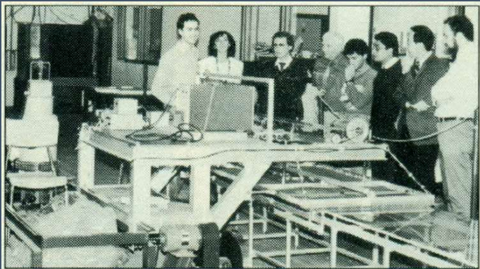
Participants in the first (1987/1988) Continuing-Education Course on Tribology by the faculty of Applied Science and Engineering at the University of Toronto inspect a large-scale laboratory model of a tilting-pad thrust bearing.