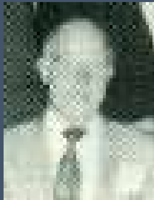
Fred Evans '63/64