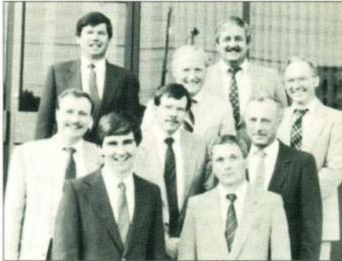
1988-89 Toronto Section executive Committee